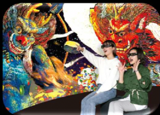
Immersive 3D Art Experience Kinutani Koji Tenku Art Museum