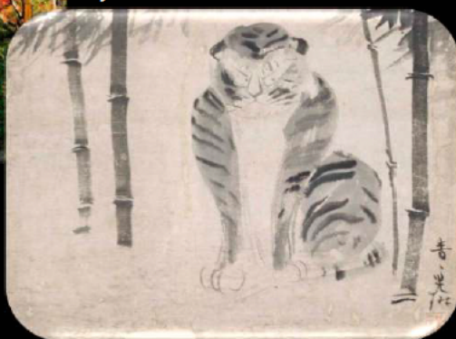
Tiger and Bamboo Kyoto National Museum