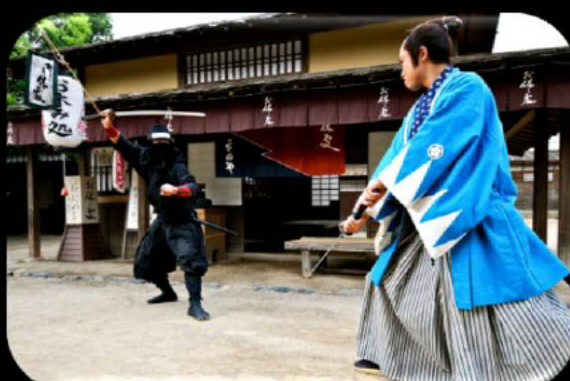
On Set Act #1 Ninja VS Samurai (Sho/Experience) TOEI KYOTO (UZUMASA JIDAIGEKI) STUDIO PARK