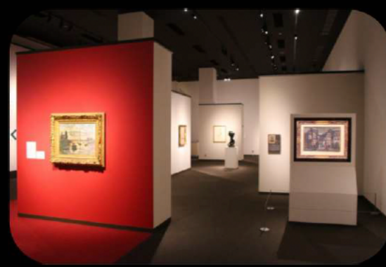
Kunitomi Collection Room: French Realism to Impressionism Himeji City Museum of Art

Facilities marked with ※ are not covered by Japan Cultural Passport